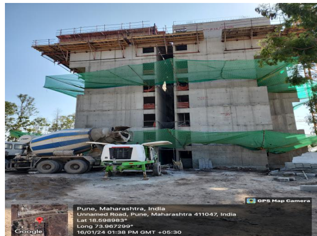
Rohan Abhilasha – Phase III